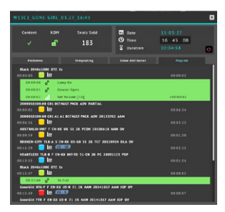
Playlist with content dynamically inserted into placeholders